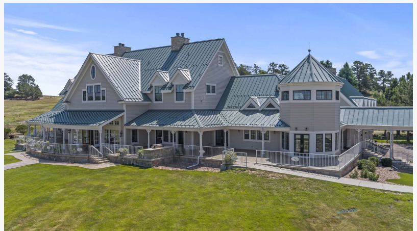
Expansive Plains Victorian-style Ranch House

Situated amid the breathtaking Rocky Mountain views of Pikes Peak and the Rampart Range, 9663 East Palmer Divide Avenue offers a versatile canvas for various visions, from event venue to equestrian enterprises and cow-calf operations. The property features expansive grasslands, Ponderosa Pine-capped vistas, and significant water rights from four different aquifers.