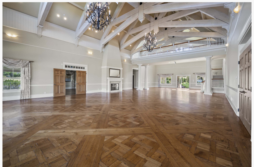
1,376-acre equestrian ranch with Pikes Peak views & commercial potential