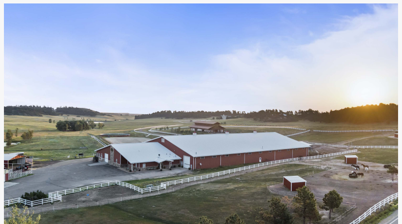
Protected open space and significant water rights