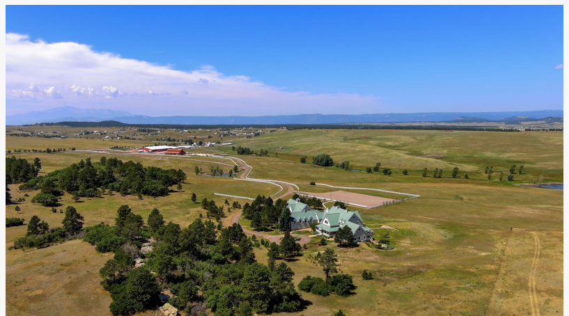
9663 E Palmer Divide Ave, Larkspur, CO 80118