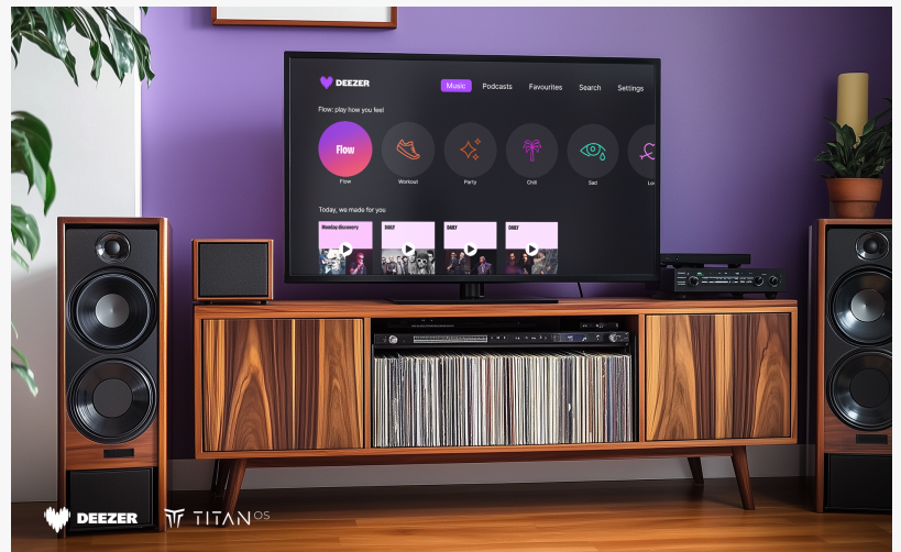
Deezer TV Set