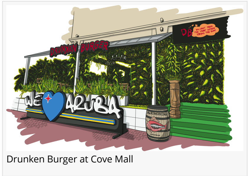
Drunken Burger at Cove Mall

According to many popular local and tourist publications, the search for gourmet burgers in Aruba is over! Drunken Burger, located at the Cove Mall, has reportedly become Aruba's top-rated casual dining experience for unique and delicious burgers, satisfying salads, sides, desserts, and an immensely entertaining drink menu.