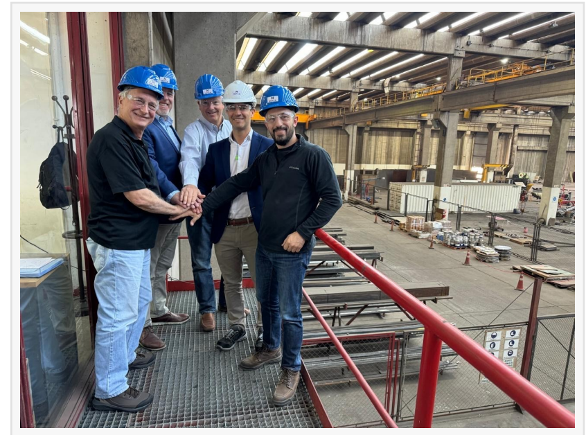
SPG / E2P Team together with new partners from Netza

SPG is a leading provider of sustainable energy solutions, and related services for the global industrial, energy and marine markets. SPG's product offerings include turbine drive trains and related solutions for electric power generation, including microgrids, datacenters, combined heat and power