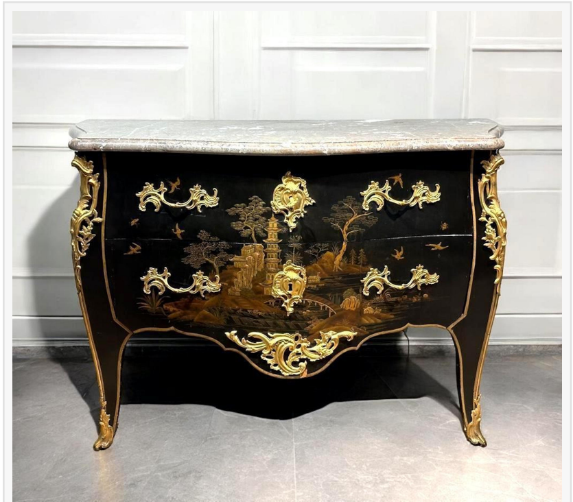
18th century French Louis XV Chinese commode with a veined marble top over a bombe case, decorated in lacquer with a multi-story pagoda in a river landscape ($17,220).

The unassuming French terracotta bust-length portrait of a young girl, 21 inches tall, was one of the true sleepers of the auction. It had a pre-sale estimate of just $500-$800, which bidders ignored. Just as surprising was the 18th century French Louis XV Chinese lacquer mounted commode, with a high estimate of $5,000. The final selling price was more than three times that.