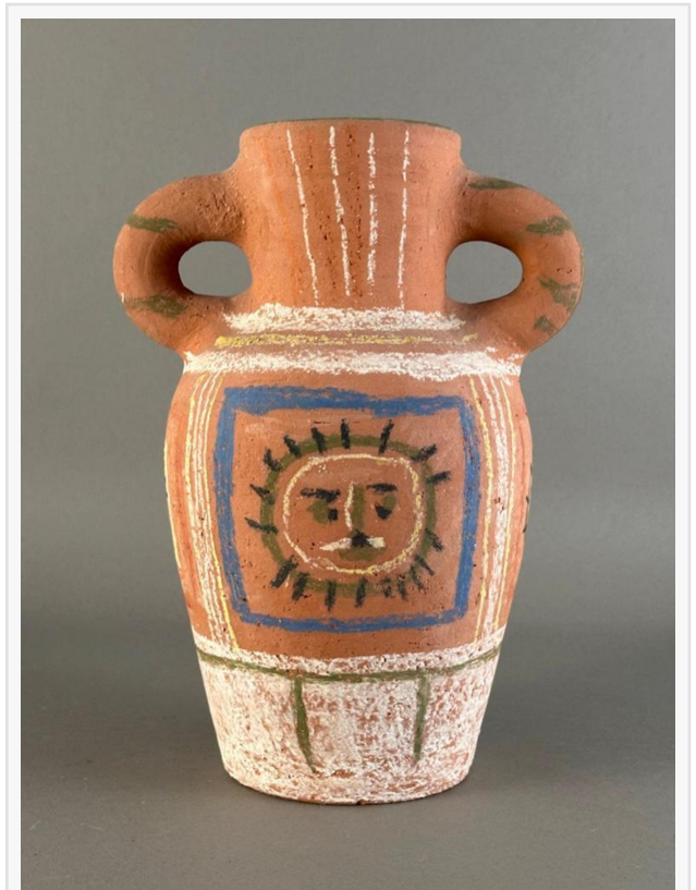
There were two ceramics by Pablo Picasso (Spanish, 1881-1973) for Madoura. One was this baluster form vase titled Décor Pastel (1953), numbered "22/200" ($10,455).