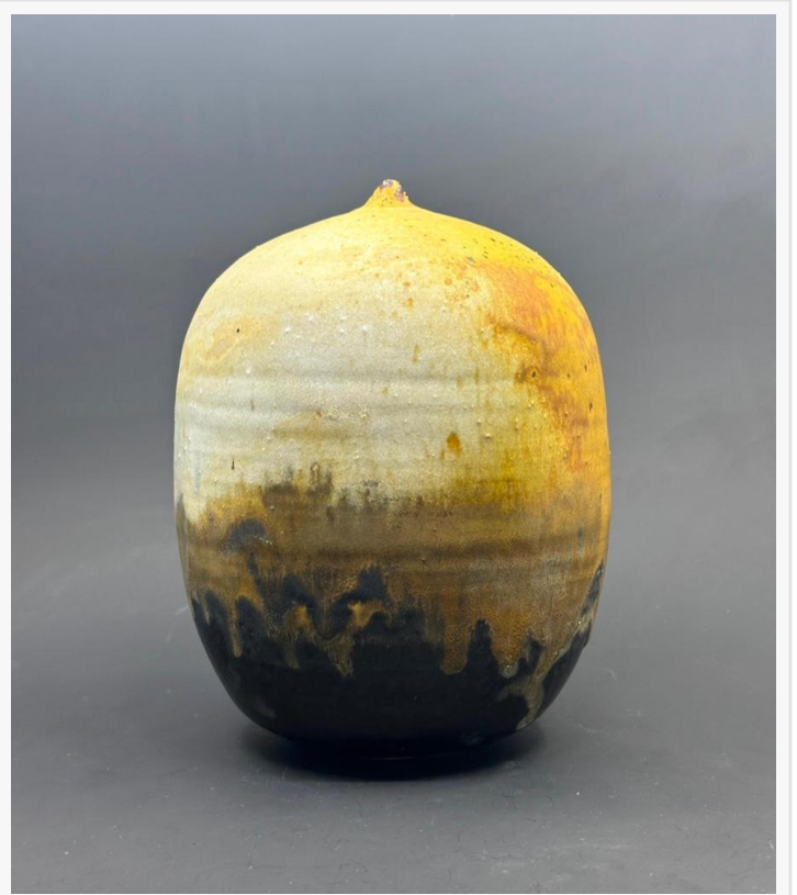
Circa 1980s closed form Anagma fired stoneware by Toshiko Takaezu (1922-2011), yellow and ochre glaze flowing down over a warm brown glaze, 7 ¼ inches tall ($10,455).

This press release can be viewed online at: https://www.einpresswire.com/article/743915938