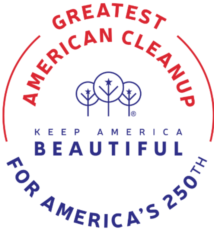
Greatest American Cleanup Logo

Northrop Grumman is also a presenting sponsor of Keep America Beautiful's Greatest American Cleanup™ , the largest litter cleanup and beautification effort in U.S. history. As part of this initiative, Northrop Grumman employees nationwide will join Keep America Beautiful affiliates