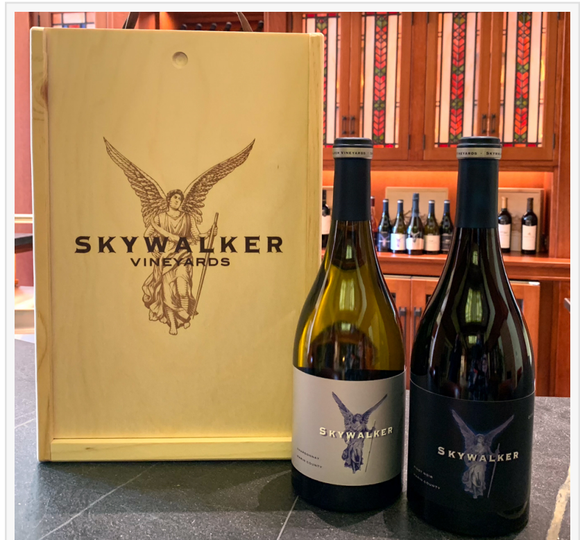
Skywalker Wines from the vineyard of Star Wars Creator George Lucas

The evening promises to be a true celebration of Star Wars fandom, with a variety of immersive experiences planned. Attendees will be treated to passed appetizers, a grazing bar, and a dessert bar, all while mingling among iconic Star Wars props and costumes in MoPOP’s extensive galleries. The event will also feature a special exhibit from Rancho Obi-Wan, showcasing Star Wars-themed guitars that are sure to strike a chord with fans of all ages.