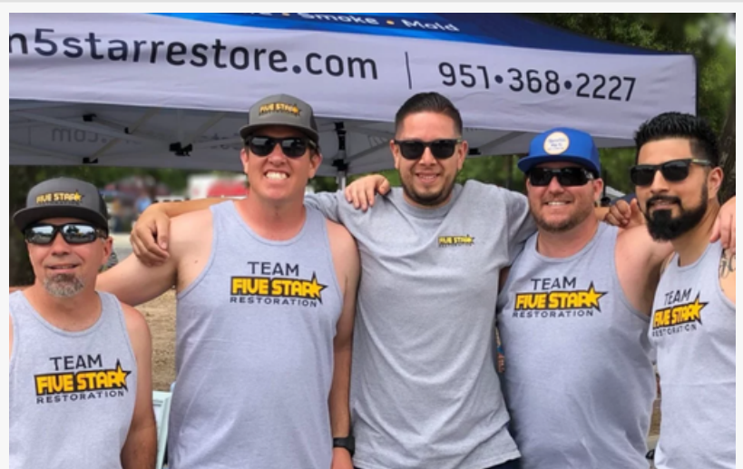
The team at 5 Star Restoration knows how to fix extensive water damage and help build warm relationships with clients

Five Star Restoration's new plumbing division offers a wide array of services tailored to address both emergency plumbing needs and routine maintenance. Their skilled team is equipped to handle everything from burst pipes, leaky faucets, and clogged drains to complex installations and re-piping projects.