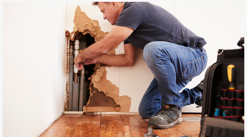
The Five Star Restoration team helps homeowners spot, and fix, water damage