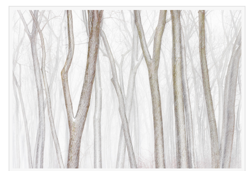
I loved how the snow, driven by the high winds, got embedded in the bark of the tree trunks. I took a few frames, trying to simplify the scene in front of me and settled on this one, loving the tones, the depth and the minimalism.