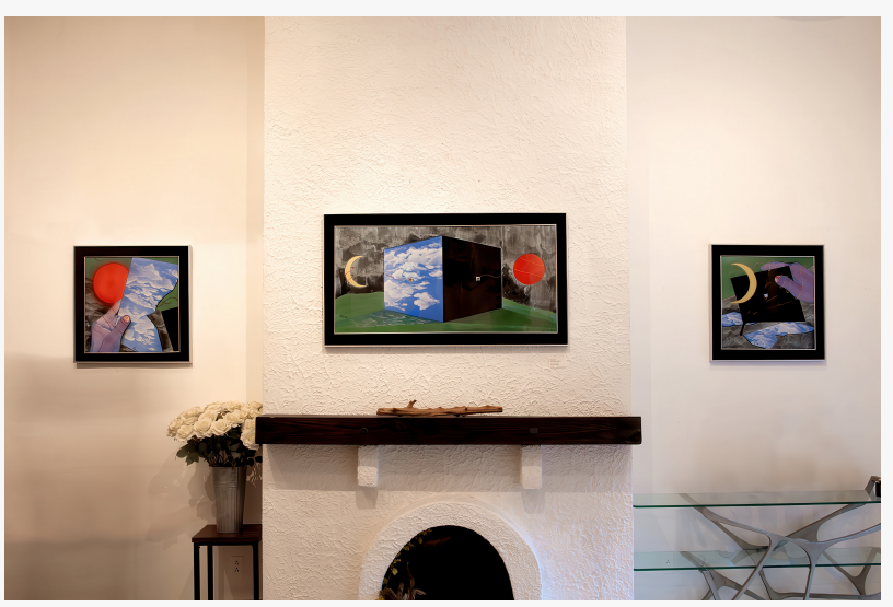
The exhibition includes 21 porcelain pieces, ranging from nature-inspired designs to abstract, contemporary illustrations

of this art form. One of the guests mentioned, "This is my first time seeing porcelain art as a painting instead of an object, I'm deeply touched by how it blends traditional elegance and contemporary concepts at the same time".