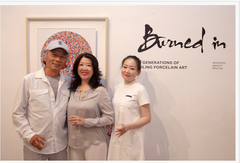
Proud to introduce this art form to New York City.

At the VIP opening night, 80 guests attended the event to engage with the exhibition and the cultural significance