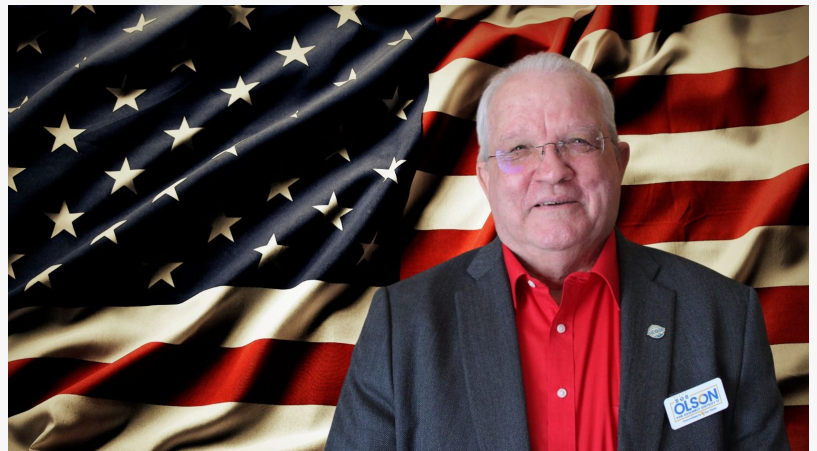
Finding Housing Solutions that Work!