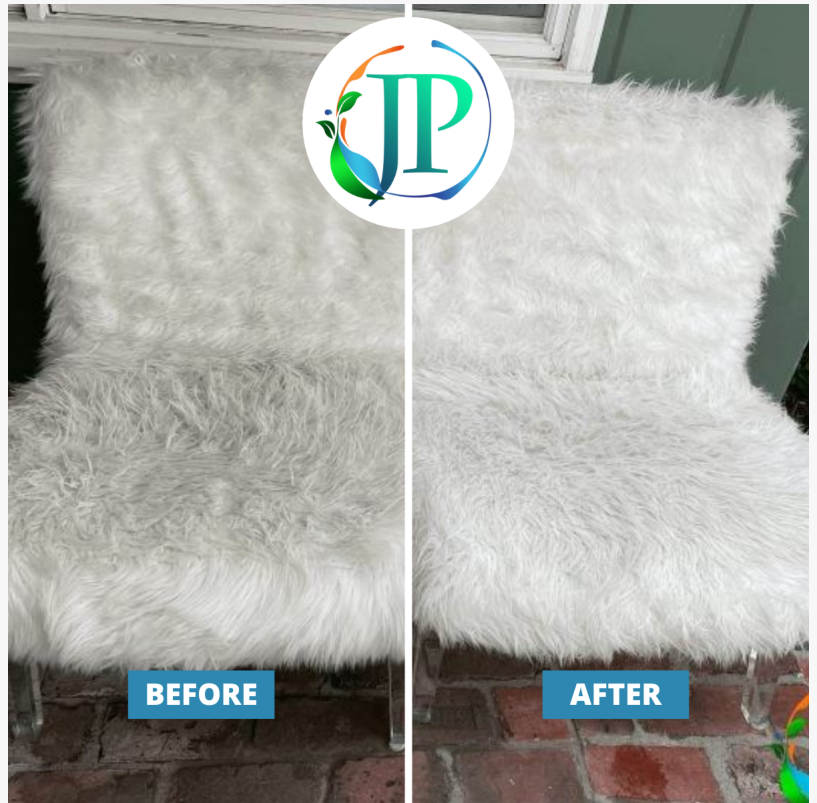
Upholstery Cleaning in Studio City