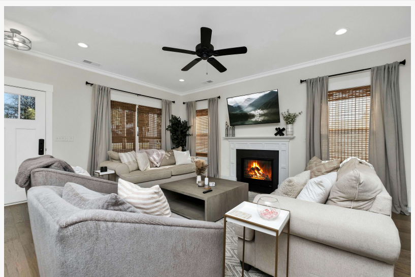
Studio City Upholstery Cleaning

This service, highlighted in full detail in a new article on the JP Carpet Cleaning Expert Floor Care website, provides Studio City residents with a reliable and professional solution to common upholstery concerns such as stains, odors, and wear and tear. From sofas and chairs to more delicate pieces, the upholstery cleaning service promises to restore and extend the life of household and commercial furniture.