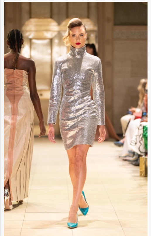
Model for Malan Breton SS2025