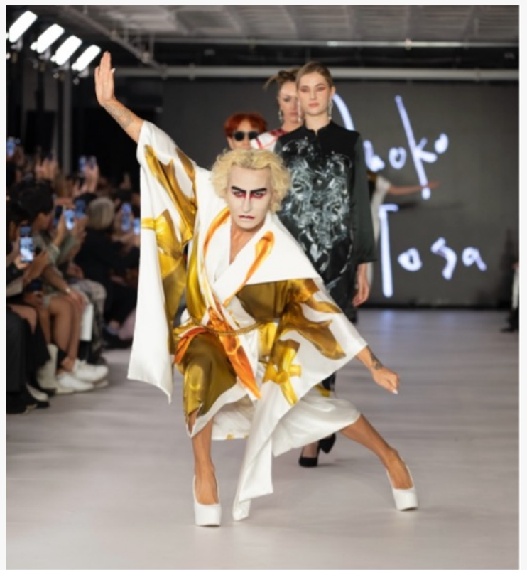
Elton Ilirjani for Naoko Tosa

This press release can be viewed online at: https://www.einpresswire.com/article/744186642