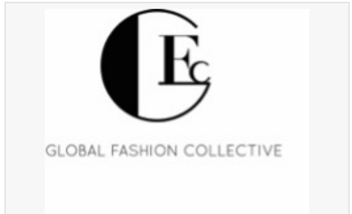
Global Fashion Collective (GFC) Logo