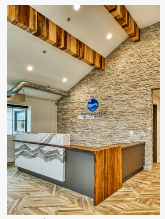
Innovo Detox Admissions

mental health professionals to develop a personalized treatment plan that addresses all aspects of their well-being. This individualized approach ensures that each person receives the care they