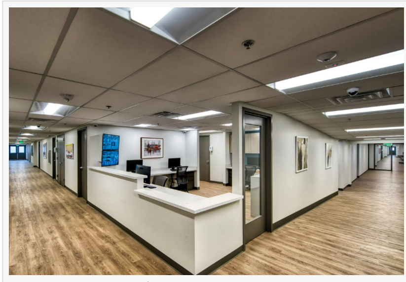
Innovo Detox Interior

About Innovo Detox Innovo Detox is a leading addiction and mental health treatment center in Pennsylvania, offering comprehensive solutions for those seeking recovery. Our integrated approach addresses both addiction and co-occurring mental health disorders, providing a holistic path to healing. From personalized detox programs to advanced withdrawal management