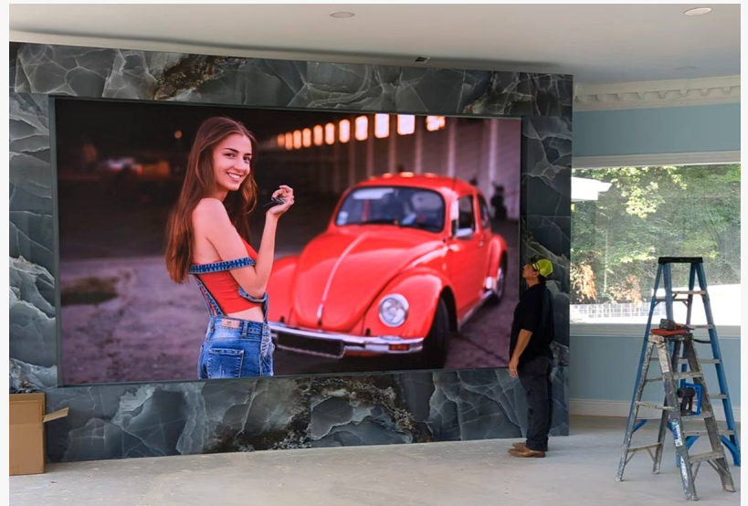
YOLO TV Indoor 190 HD Inch TV in Virginia