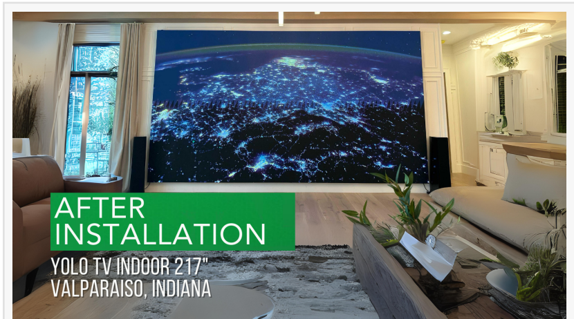
After 217 inch YOLO TV Indoor TV was installed

Christine Lock YOLO TV +1 214-989-6072 email us here