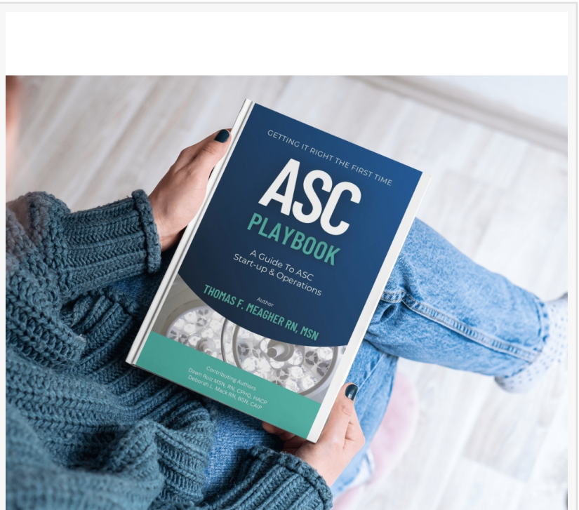
ASC Playbook Cover Photo

Together, these healthcare leaders offer readers an essential toolkit for navigating the unique challenges faced by ASCs, with a focus on strategic planning, quality improvement, and leadership development.