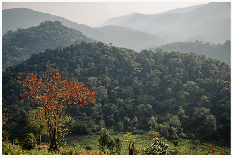
Asilia Erebero Hills - Bwindi Forest

resource that is locally sourced, supporting sustainable bamboo plantations in the region. Designed in collaboration with <u>Pablo Luna Studios</u> in Bali, the lodge's architecture will harmonize with the natural landscape, drawing inspiration from the organic shapes of leaves and the