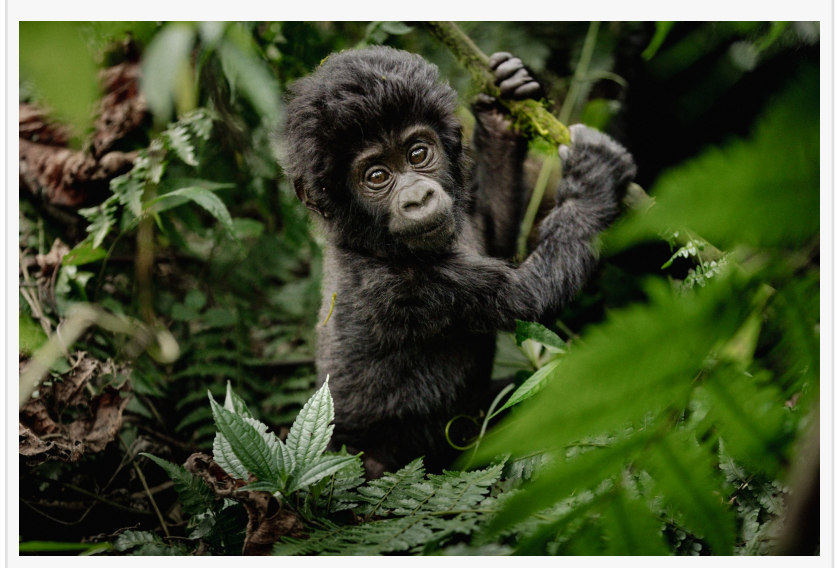
Asilia Erebero Hills Baby gorilla standing