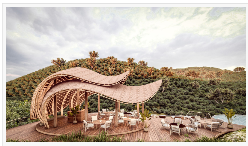
Asilia Erebero Hills Lodge Pool and Bar

The lodge is being constructed primarily from bamboo, a renewable