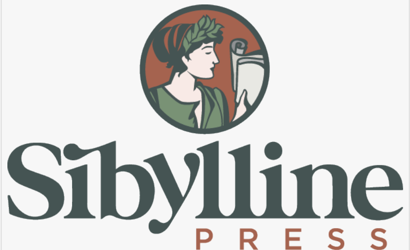
Sibylline Press Logo