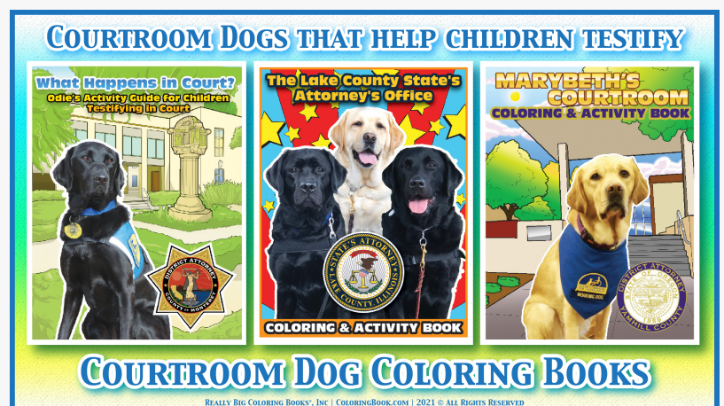
Courtroom Dogs that help children used by social workers, educators, law enforcement officials 314-695-5757