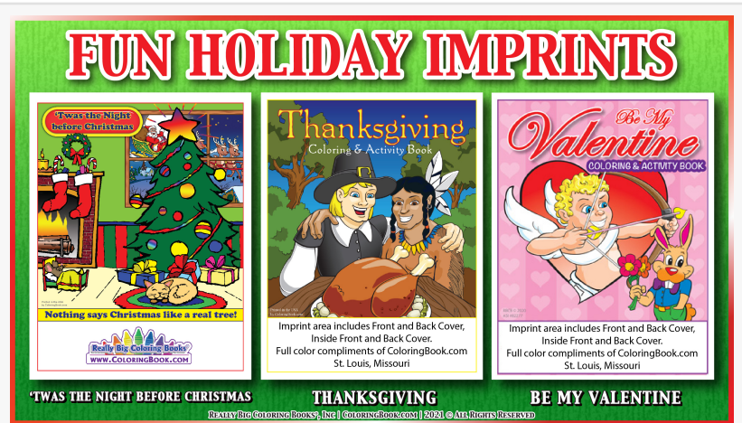
Fun Holiday Imprint Coloring Coloring Books from ColoringBook.com

Custom imprint coloring books are a creative and effective way to promote health, safety, and