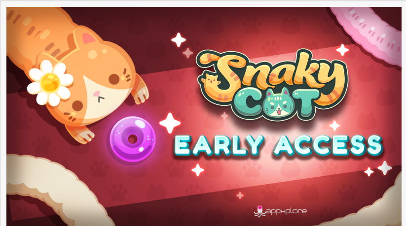
Snaky Cat Google Play Early Access Live Now