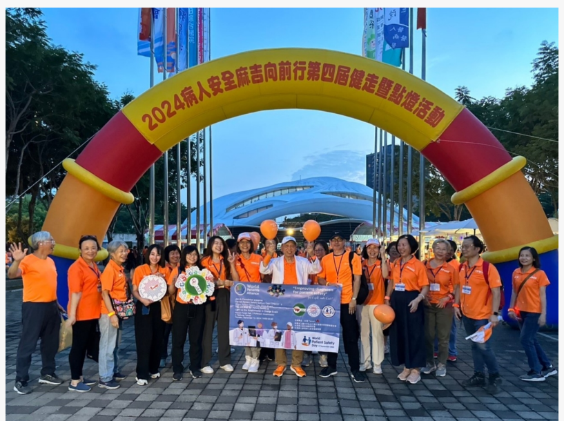
World Patient Safety Day 2024 Event Organizers

The 1.2 km “Walk for Patient Safety” took the participants around the picturesque Wenxin Forest Park, and the “Light Up the Amphitheater in Orange” ceremony was held at the newly renovated