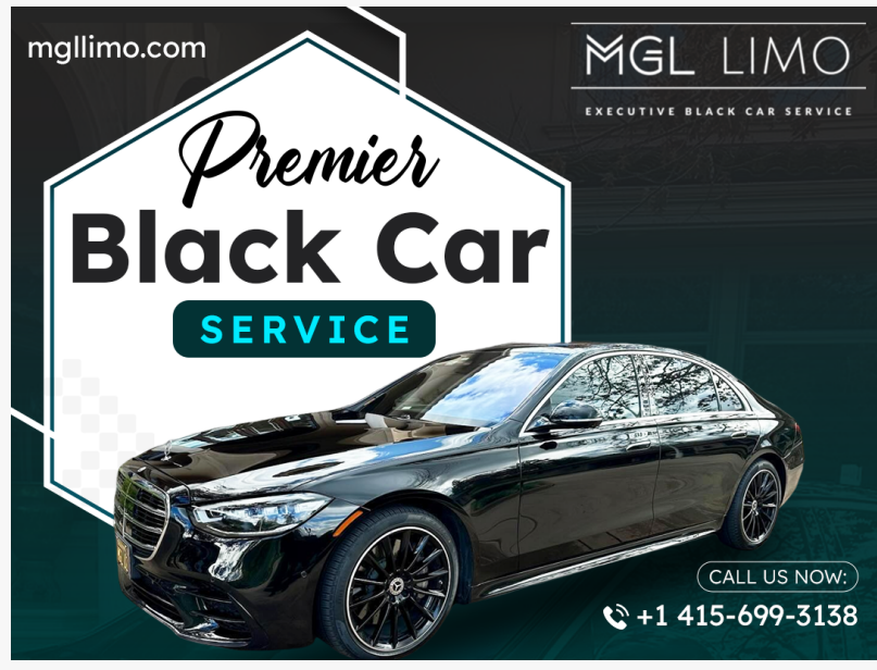
black car limo