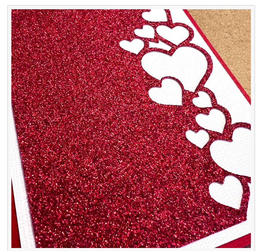
RUBY RED Glitter Luxe Cardstock - Encore Paper

Partnership with Renowned Brands: 12x12 Cardstock Shop is thrilled to announce a strategic partnership with leading brands in the crafting industry as part of its expansive product line initiative. This collaboration includes