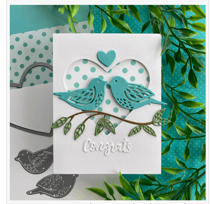
LAGOON - 12x12 Pearlescent Cardstock - Neenah Stardream

well-respected names such as BAZZILL, NEENAH, and AMERICAN CRAFTS, known for their