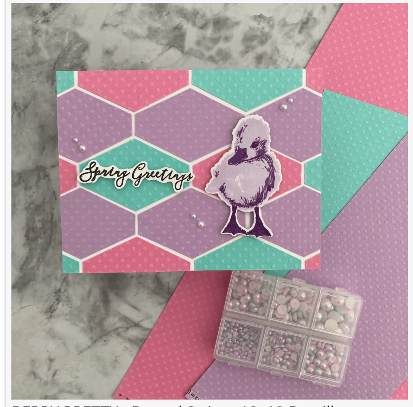
BERRY PRETTY - Dotted Swiss - 12x12 Bazzill Cardstock

12x12 Cardstock Expands Product Line to Celebrate Record-Breaking Year