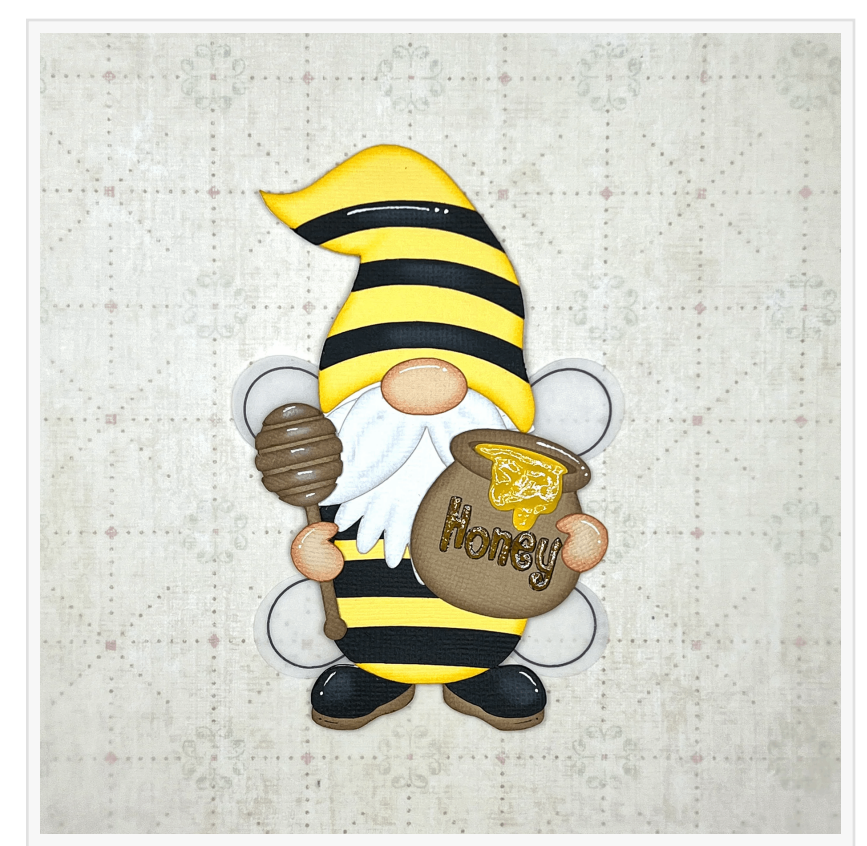
HONEY BEAR - Textured 12x12 Cardstock

The 250,000 positive reviews reflect not only the high quality of the products