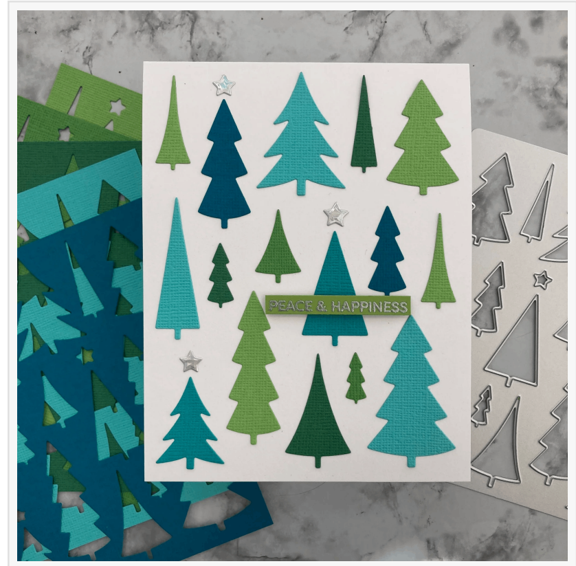
TURQUOISE NECKLACE - Textured 12x12 Cardstock - Encore Paper

PROVO, UT, UNITED STATES, October 4, 2024 /EINPresswire.com/ -- Summary: 12x12 Cardstock Shop proudly marks a significant milestone with 250,000 positive customer reviews, reflecting its leading position in the scrapbooking industry. Offering an expansive range of scrapbook paper and essential scrapbooking supplies, the shop has earned the trust and appreciation of the crafting community. This achievement showcases the brand's commitment to delivering top-tier products and exceptional service to hobbyists and professionals alike. With its continuous growth, 12x12 Cardstock Shop remains a trusted destination for