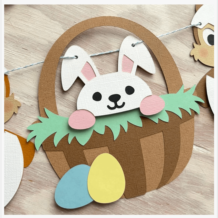
CATTAIL Textured 12x12 Cardstock - Encore Paper

but also the company's commitment to creating a satisfying customer journey. The brand remains dedicated to maintaining this high standard, ensuring that every interaction with its