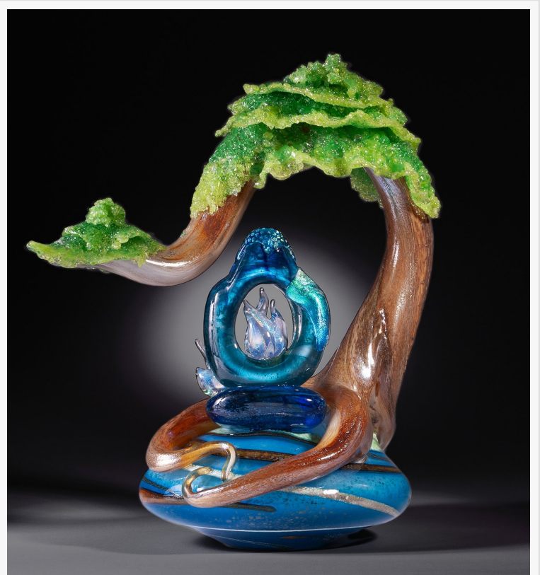
Eli Cecil - The Passion Tree

The Delray Beach Downtown Development Authority (DDA) was established in 1971 with a mission to grow, strengthen, and enhance the economic vitality of Downtown Delray Beach. As