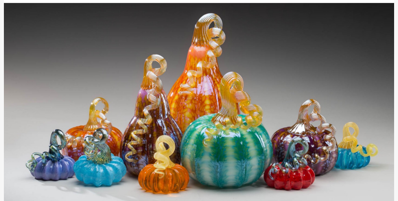
Hot Glass Exhibit