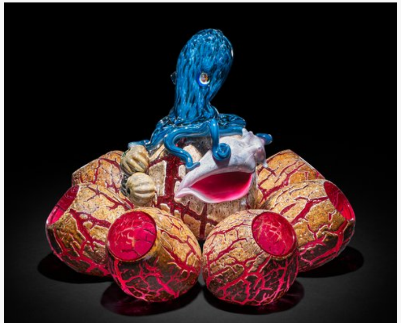
Josh Fradis - Octopus Habitat