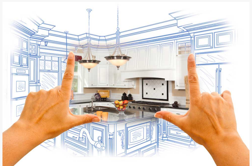
A Partner Driven mentor meets with a real estate investor to discuss strategic investment decisions. The modern office setting includes charts, property listings, and a laptop showing investment trends. This scene highlights the expert guidance provided b