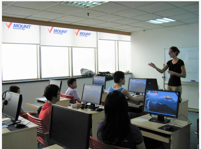
Knowledge Generator being used in classrooms.