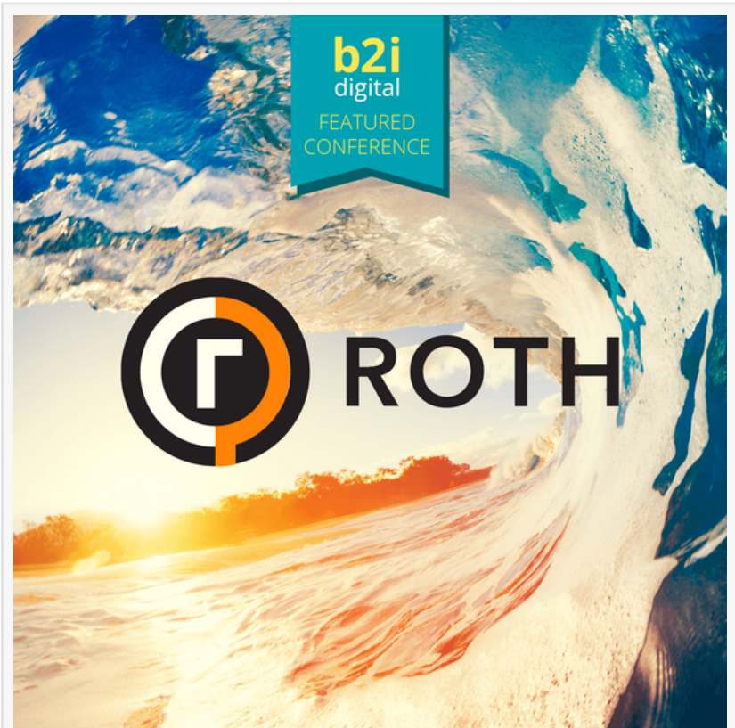
ROTH Healthcare Opportunities Conference - A B2i Digital Featured Conference

Allurion Technologies, Inc. (ALUR) Beyond Air, Inc. (XAIR) Biofrontera Inc. (BFRI) BioRestorative Therapies, Inc. (BRTX) Cardiol Therapeutics Inc. (CRDL) Celectar Biosciences, Inc. (CLRB) CervoMed Inc. (CRVO) Chemomab Therapeutics Ltd. (CMMB) Cingulate Inc. (CING) Cognition Therapeutics, Inc. (CGTX) Entero Therapeutics Inc. (ENTO) Fortress Biotech, Inc. (FBIO) Gain Therapeutics, Inc. (GANX) GeoVax Labs, Inc. (GOVX) GT Biopharma, Inc. (GTBP) iRadimed Corp. (IRMD) Journey Medical Corp. (DERM) Longeveron Inc (LGVN) Moleculin Biotech, Inc. (MBRX) Nuvectis Pharma, Inc. (NVCT) Nuwellis, Inc. (NUWE) Oncolytics Biotech Inc. (ONCY) Orthofix Medical Inc. (OFIX) Ovid Therapeutics Inc. (OVID) Replimune Group, Inc. (REPL)