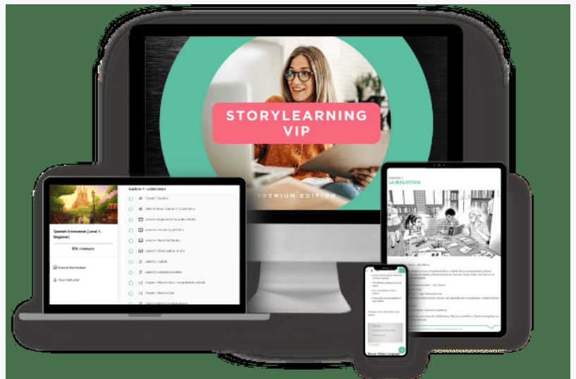
Learn Spanish with StoryLearning's Short Story Books