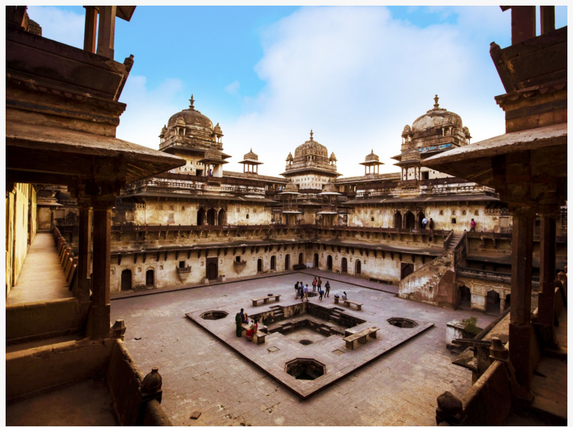
Jahangir Mahal - Orchha