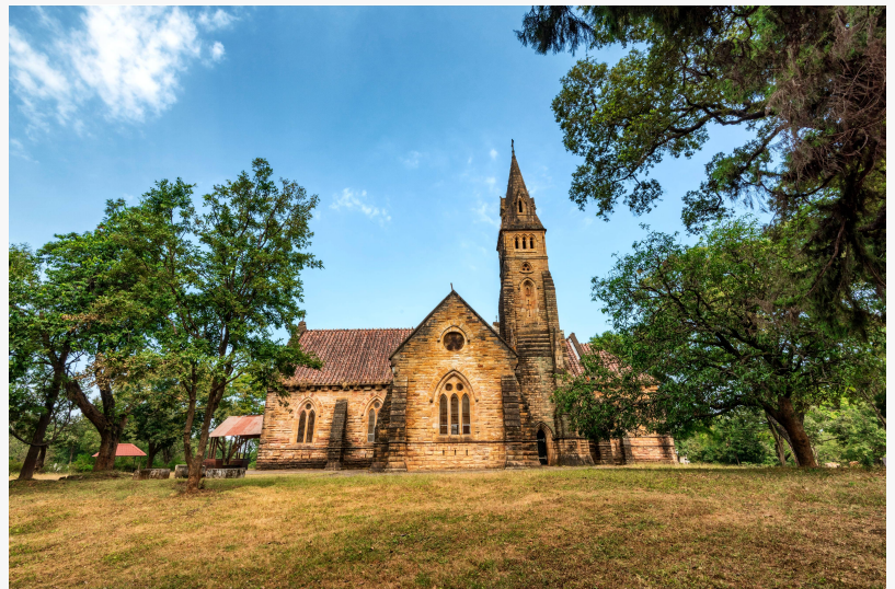
Christ Church Pachmarhi