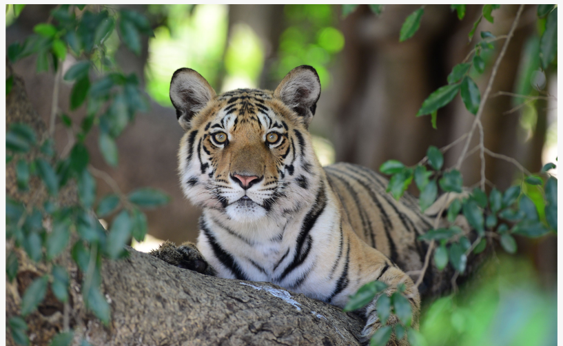
Panna Tiger Reserve in Madhya Pradesh