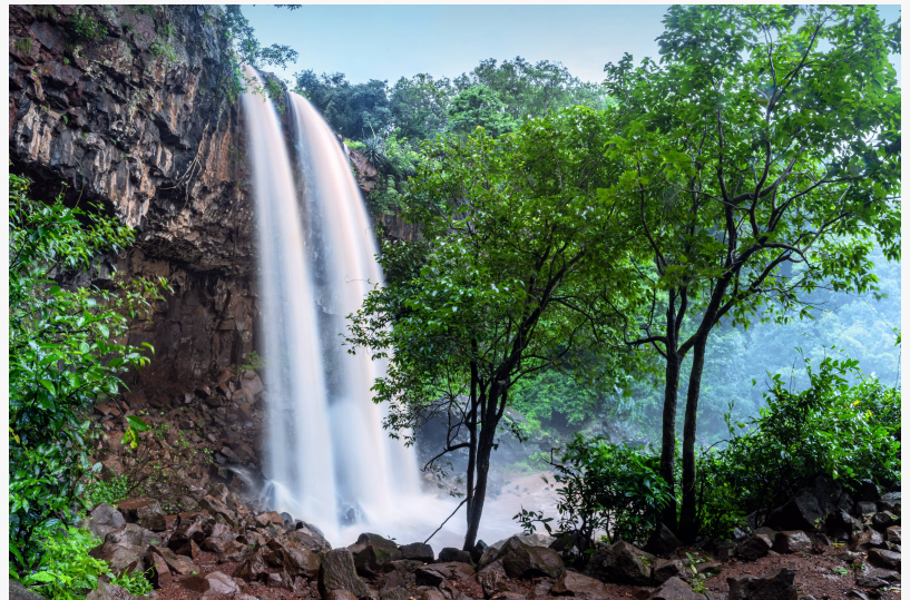
Kapil Dhara Fall - Amarkantak