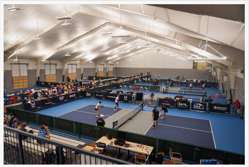
NPL's second-annual Championship Weekend will be held at The Pickle Lodge, a premier facility in West Chester Township, Ohio, just outside Cincinnati.

The NPL's second-annual Championship Weekend, a landmark event that showcases the growing sport of pickleball and the elite talents of its Champions Pro (age 50+) players, will be held at The Pickle Lodge, a premier facility in West Chester Township, Ohio, just outside Cincinnati from October 17 to 20. The venue features 17 dedicated, individually fenced, indoor courts and previously hosted an NPL regular season tournament in July.