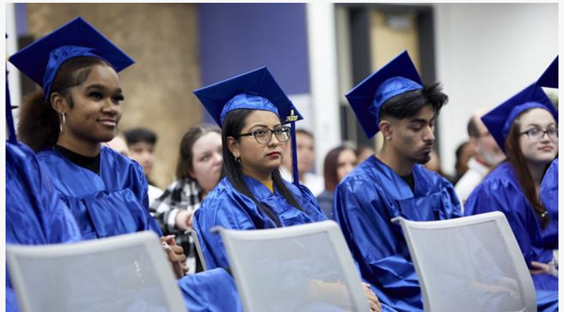
Omega School December 2023 Graduation.