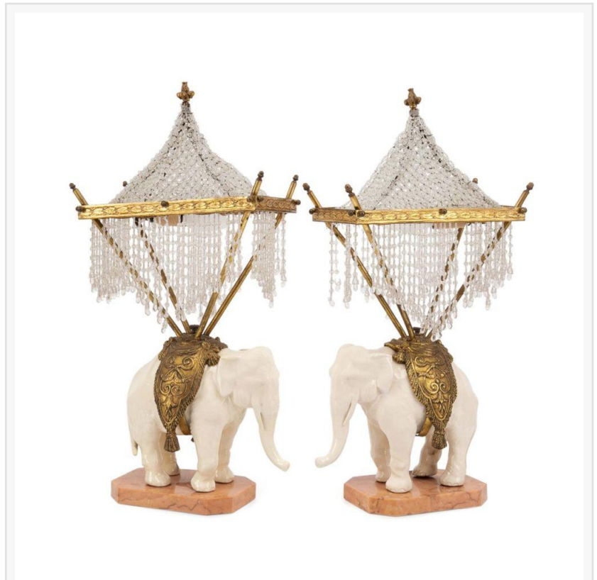
Pair of French mid-20th century bronze chinoiserie porcelain blanc de chine elephant table lamps boasting a beaded palanquin shade, gilt bronze howdah and a pink marble base ($7,260).

The Henner painting – titled The Distraught Woman (or Weeping Magdalene ) was a haunting mid-19th century depiction of a kneeling redhead, her head buried in her hands in a pose of obvious sadness or distress. The work measured 13 \frac{3}{4} inches by 10 \frac{3}{4} inches (canvas, minus frame) and was artist signed. It easily blew through the $2,000-$4,000 pre-sale estimate and had a Christie's paper label on verso.