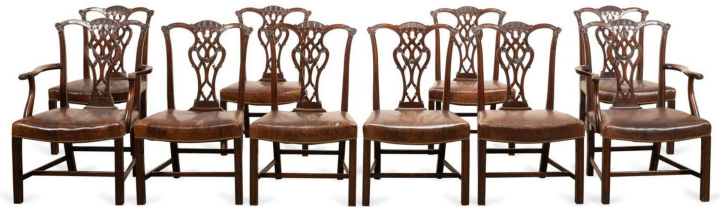
Set of ten early 20th century English Chippendale style mahogany dining chairs, each one outfitted with a leather saddle seat and nailhead trim ($6,050).