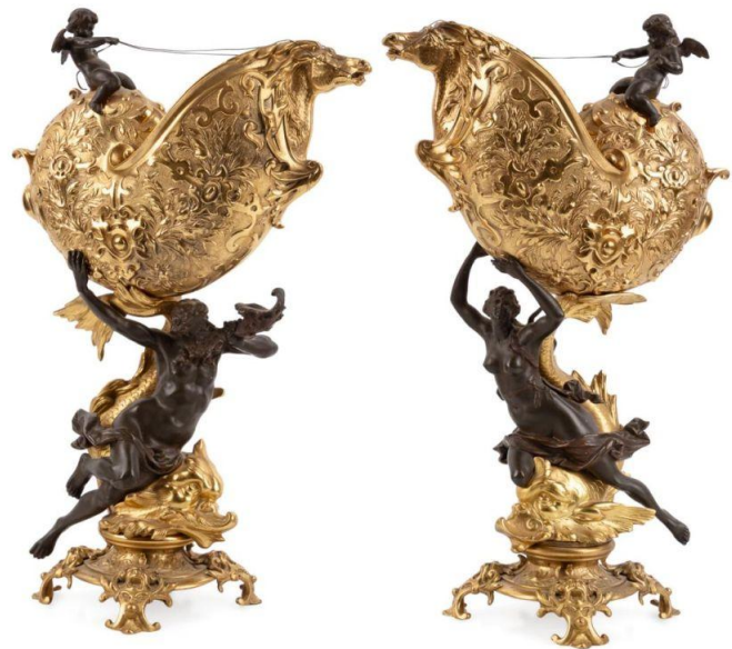
Pair of 19th century French patinated and gilt bronze marine motif table garnitures, modeled as Poseidon and Amphitrite riding dolphins, each holding aloft a nautilus shell driven by Cupid ($5,445).