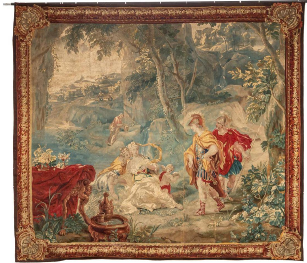
French late 19th century mythological scene tapestry depicting two gentlemen in uniform – possibly Aristotle and Alexander the Great – greeting maidens in a landscape while Cupid looks on ($5,748).

A pair of Chinese Export porcelain nodding head lady candle holders – mirror image standing figures in ochre and cobalt-colored robes with gilt accents, holding vases, and raised on square foliate decorated plinths – unmarked, surpassed the $3,000 high estimate