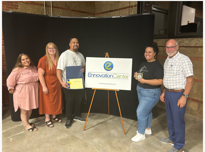
2nd place winner Aleuro Bakery

This press release can be viewed online at: https://www.einpresswire.com/article/744889192 EIN Presswire's priority is source transparency. We do not allow opaque clients, and our editors try to be careful about weeding out false and misleading content. As a user, if you see something we have missed, please do bring it to our attention. Your help is welcome. EIN Presswire, Everyone's Internet News Presswire™, tries to define some of the boundaries that are reasonable in today's world. Please see our Editorial Guidelines for more information. © 1995-2024 Newsmatics Inc. All Right Reserved.