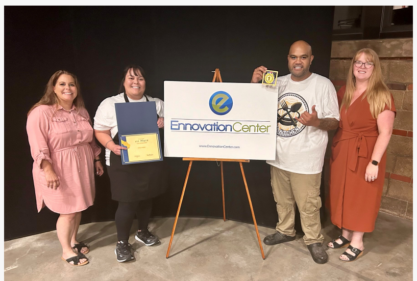
1st place winner Uce's Kitchen