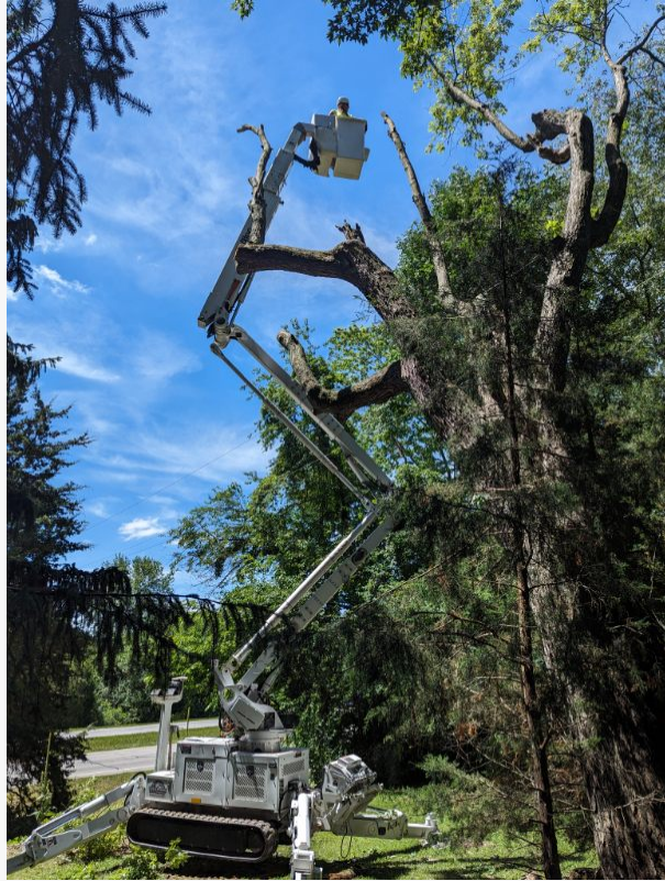
Crews clean up in the aftermath of the storm

This growth has also extended beyond state lines, as Williams Tree Company has built a reputation for its emergency storm response services nationwide. The company has responded to major storm events across the country, providing essential tree removal , debris clearing, and emergency support in times of crisis.