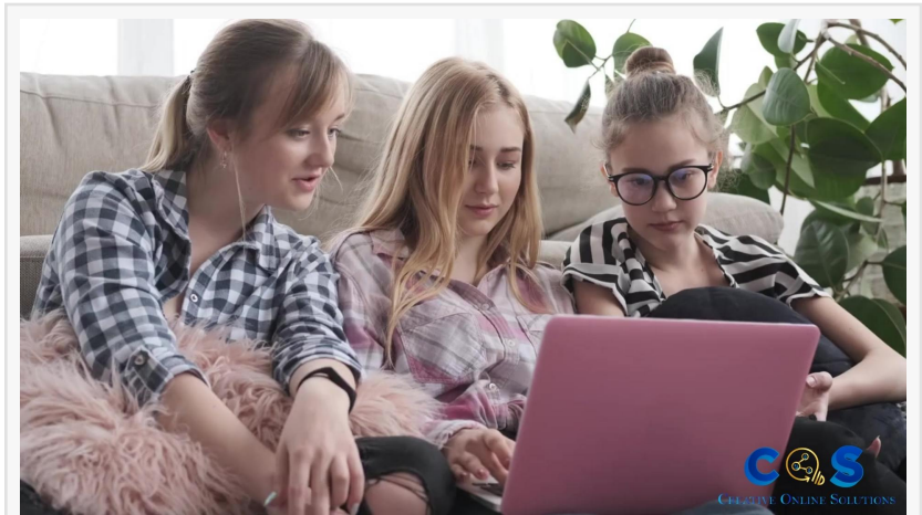
Social Media Management Agency Orlando