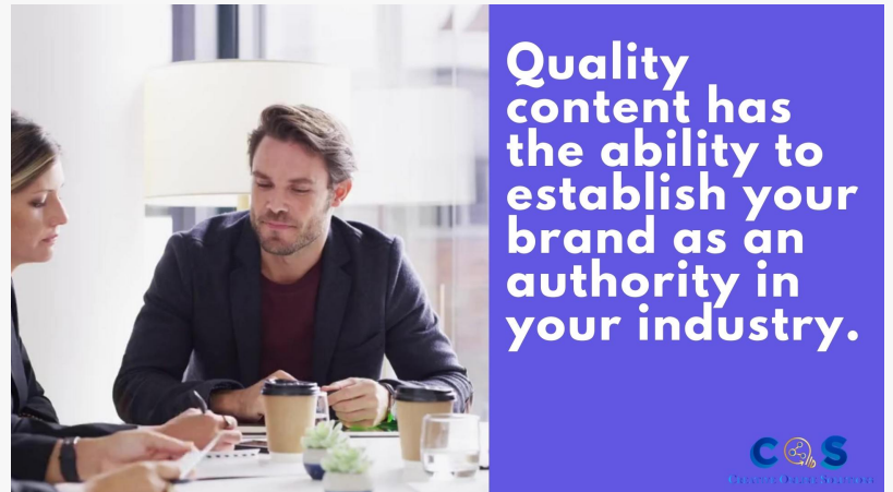
Social Media Brand Authority