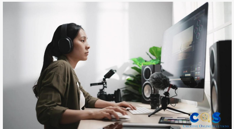
Social Media Marketing Coaching Orlando