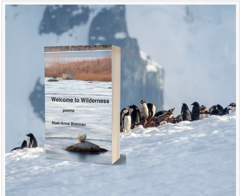
Welcome to Wilderness: Poems

understanding of the beauty and interconnectedness of humans and nature.