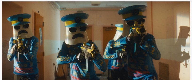
Still Image of Clone Cops