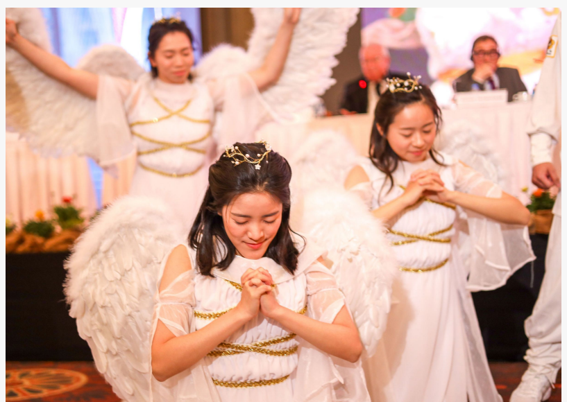
Members of FOWPAL, dressed in angel costumes with pure white wings, will perform a song symbolizing the awakening of people's conscience.

This event, organized by Good News Corporation in collaboration with the Manhattan Borough President and OMMM, features several highlights including a five-hour clean energy concert. Prominent United Nations Peace Ambassadors such as Dr. Jane Goodall, Michael Douglas, Leonardo DiCaprio, Stevie Wonder, and UNICEF Ambassador Shakira, will participate online. Additionally, the event will showcase the largest Peace Friendship Tree art installation created by the Eastern Art Foundation in Times Square. The Tree symbolizes the collective effort for peace, love, and Mother Earth.