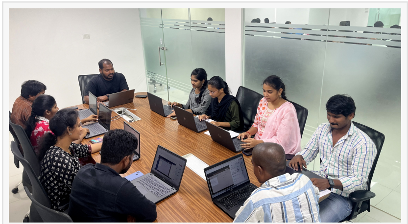
FUNNL NEW OFFICE CONFERENCE HALL

"This new office is a reflection of our confidence in the future. As we grow, it's essential to provide our team with the resources and space they need to succeed. The additional seating capacity will allow us to bring in more top talent, which will be critical as we expand our services and continue delivering measurable sales outcomes for our clients."