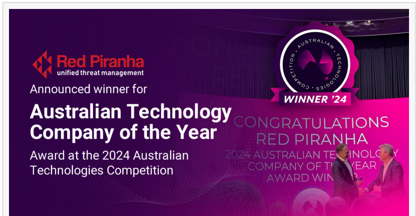
Red Piranha wins the Australian Technology Company Of The Year