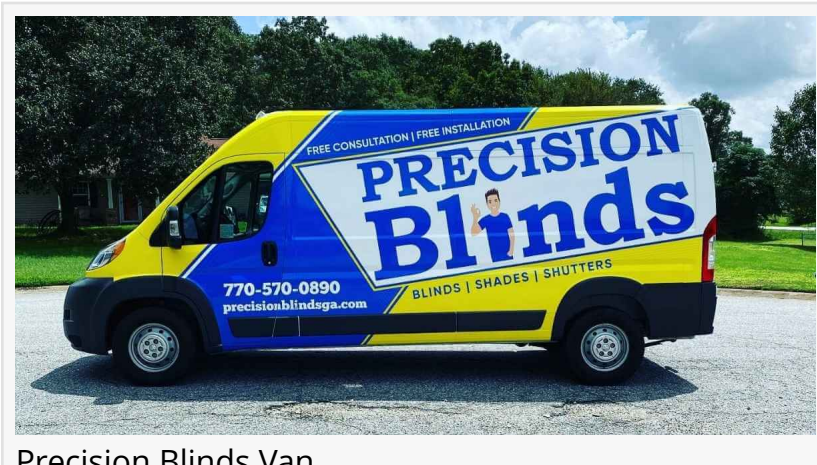
Precision Blinds Van

In addition to SEO enhancements, the collaboration with Window Treatment Marketing Pros includes a comprehensive digital marketing strategy with pay-per-click (PPC) advertising, ensuring that Precision Blinds reaches its target audience more effectively.