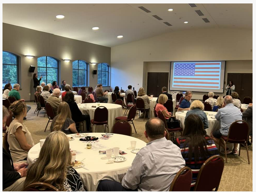
VFAF Veterans for Trump the movement film premiere crowd

With exclusive footage, "VFAF Veterans for Trump: The Movement" is an eye-opening journey through the challenges and hopes of a nation at a crossroads. The documentary not only highlights the issues but also inspires action, urging viewers to join the fight for a better future. Prepare to see the untold story of America's fight for survival and revival.