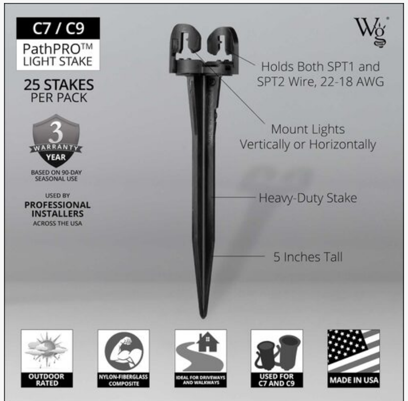
Wintergreen Lighting PathPRO Pathway Light Stake Features 1