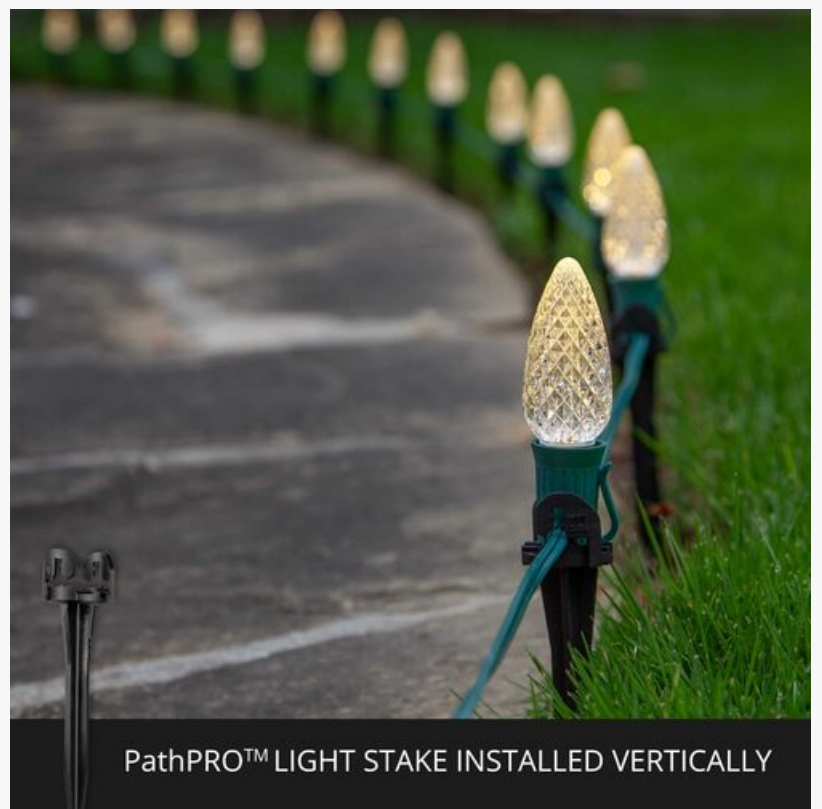
PathPRO™ LIGHT STAKE INSTALLED VERTICALLY

Wintergreen Lighting PathPRO Pathway Light Stake Installed Vertically