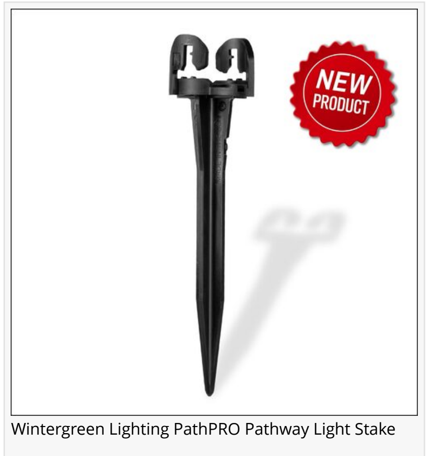
Wintergreen Lighting PathPRO Pathway Light Stake

Wintergreen Lighting's PathPRO™ Stakes are now available through Wintergreen's wholesale channel. For more information or to become a wholesale customer, visit wintergreencorp.com .