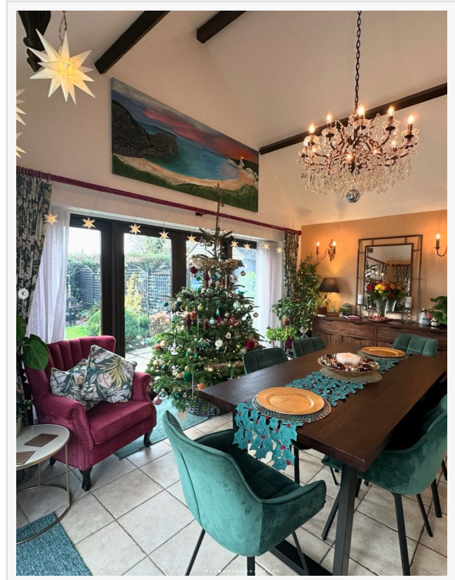
Thanksgiving and Christmas spent at Well Cottage

About English Cottage Vacation English Cottage Vacation, located in Dorset, England, offers year-round, all-inclusive, tailor-made holiday experiences that blend traditional British