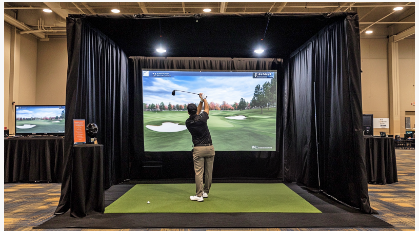
Golf Simulator at the Trade Show