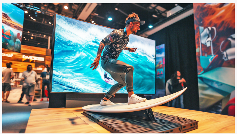
Surf Simulator at the Trade Show

Los Virtuality has been a staple in the Los Angeles community for over 7 years, providing a