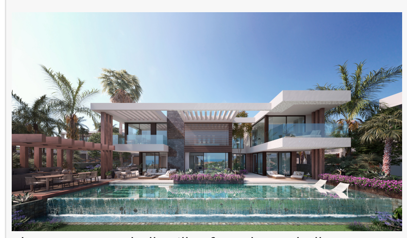
The Avenue Marbella villas for sale Marbella

The region's combination of desirable living conditions and financial accessibility continues to attract a growing international clientele, contributing to its evolving status as a premier global real estate hub.