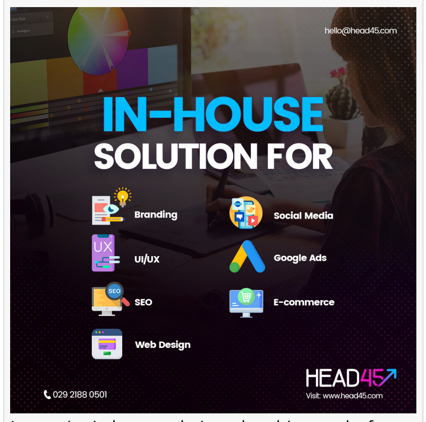
Innovative in-house solutions that drive results for Head45 Agency and its clients