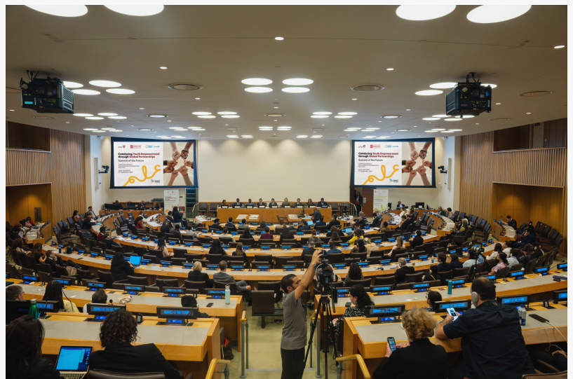
EAA - VIEW OF THE EVENT

DOHA, QATAR, September 23, 2024 /EINPresswire.com/ -- Education Above All (EAA) Foundation , Silatech, and UNICEF's Generation Unlimited (GenU) recently announced the signing of an agreement to train and mobilize 565,670 young people to access education, tackle climate change, and become community volunteers and entrepreneurs driving sustainable development efforts across Jordan, Lebanon, and Egypt.