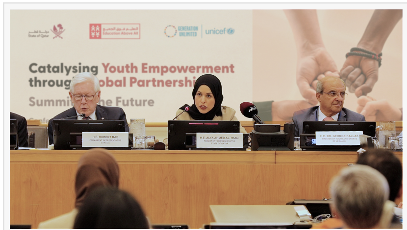
EAA - HIGH-LEVEL EVENT

The session was chaired by H.E. Ambassador Sheikha Alya Al Thani, Permanent Representative of Qatar to the United Nations, and featured participation from Qatar's Minister of State for International Cooperation H.E. Lolwah bint Rashid Al Khater, alongside numerous ministers, distinguished figures, representatives from the United Nations, youth advocates.